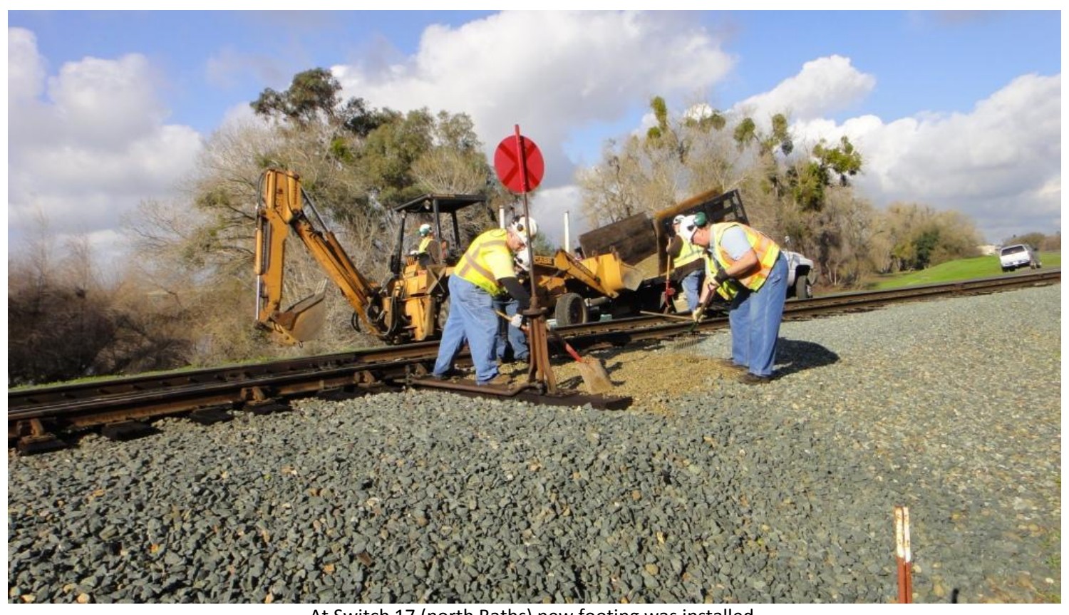
At Switch 17 (north Baths) new footing was installed.