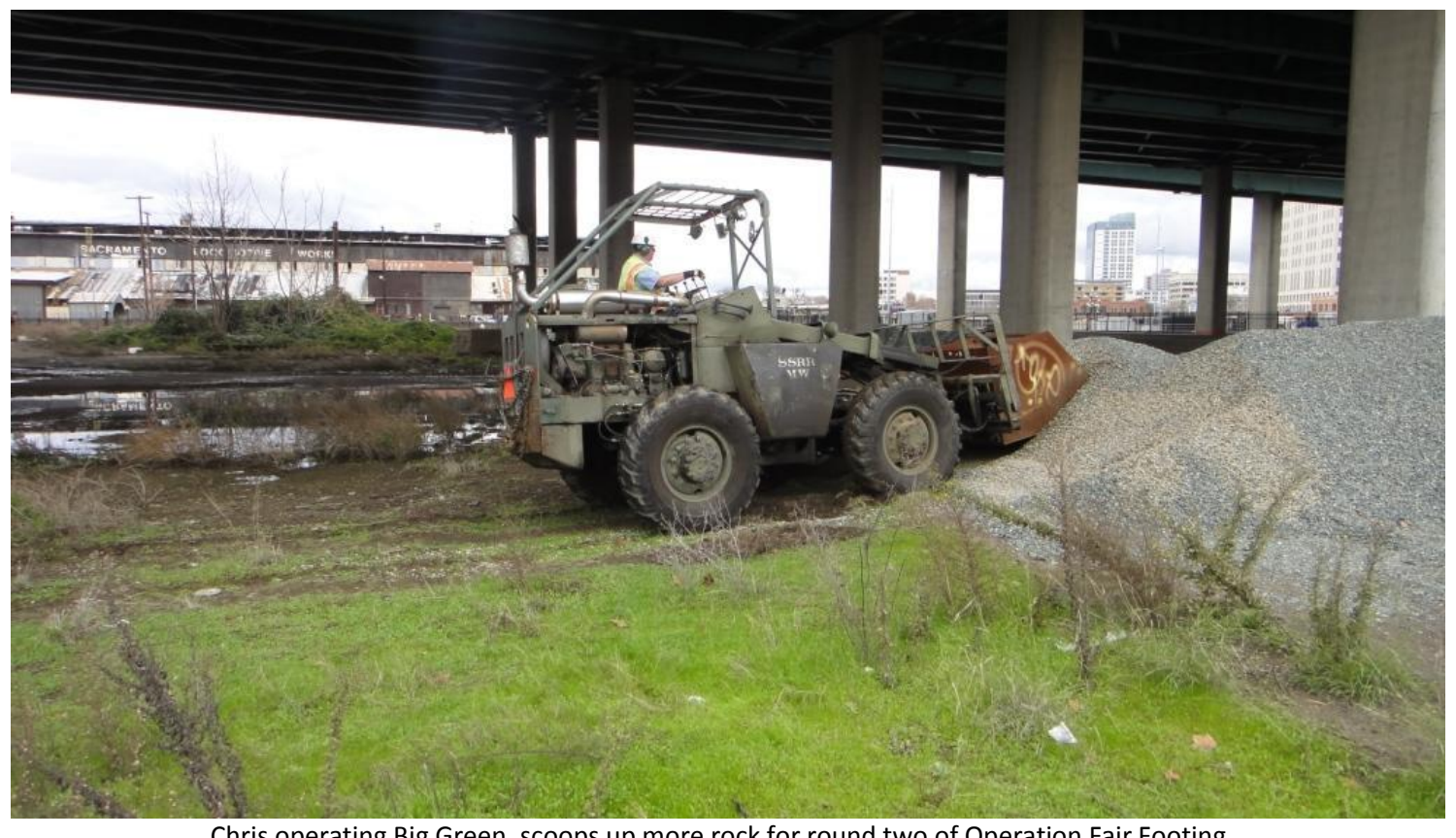
Chris operating Big Green, scoops up more rock for round two of Operation Fair Footing...