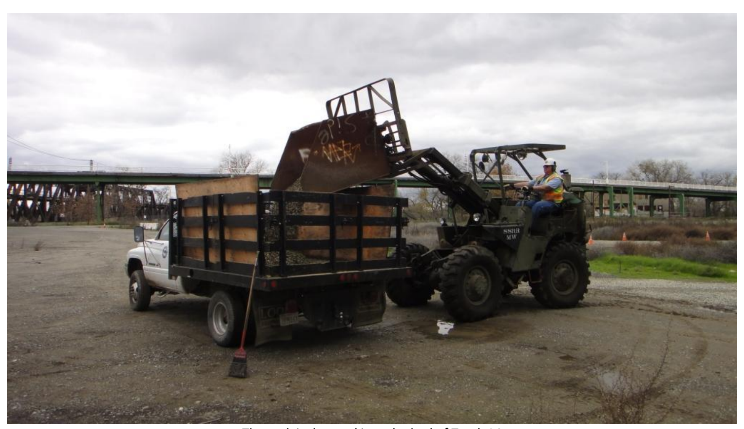
The rock is dumped into the bed of Truck 14