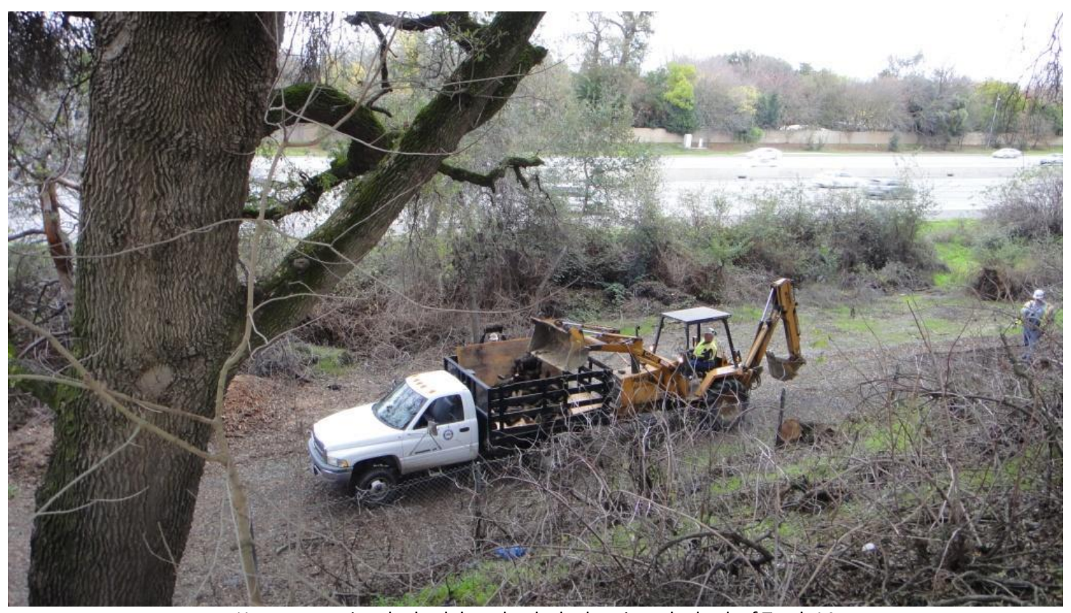
Harry, operating the back-hoe, loads the logs into the back of Truck 14