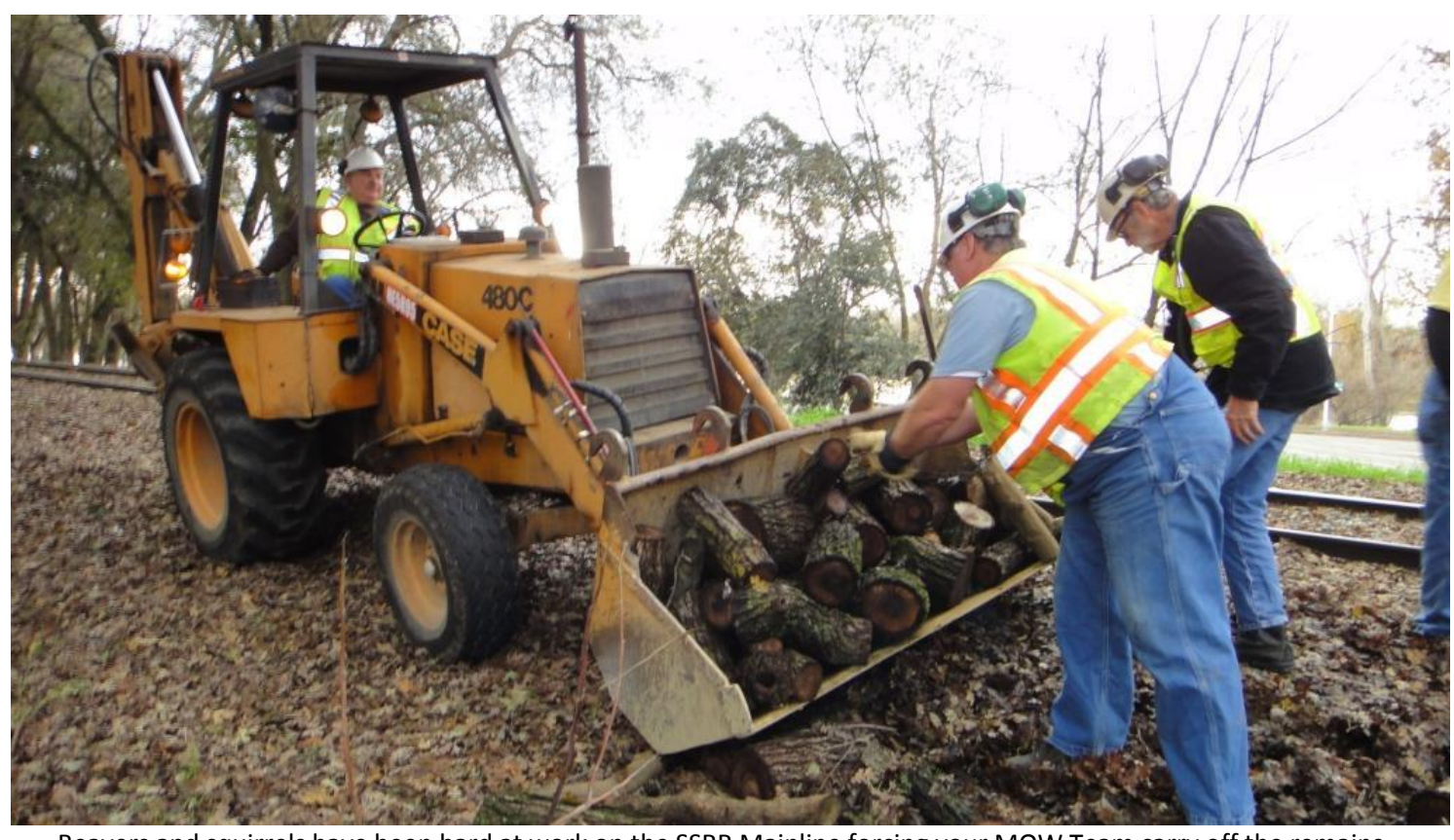
Beavers and squirrels have been hard at work on the SSRR Mainline forcing your MOW Team carry off the remains...